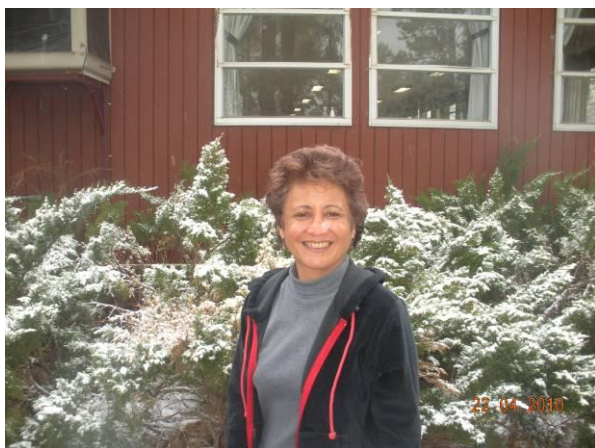
Great to have a little bit of snow at Heber!