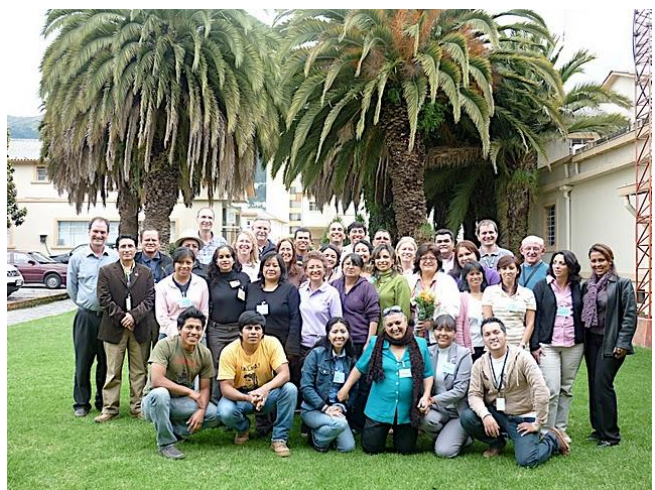
Group Presentation-The church in the community Group on training - Wonderful group : )