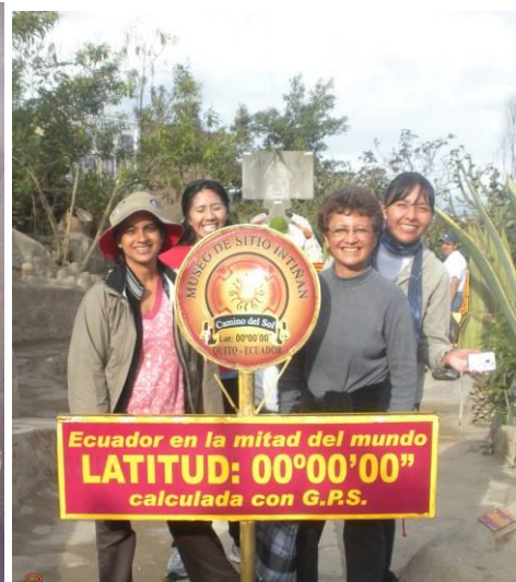
Museum in the middle of the world