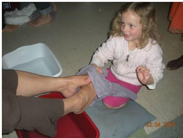
Even the children were part of this special time!

After our time at Heber I was able to spend two more days at the office. It was a time to catch up with administrative/office issues and also a time to contact friends and donors. I had the blessing to see many of my friends in Az and also to talk on the phone with many of you from other parts of the US. I'm sorry I missed some of you and I was only able to leave messages on answering machines, but I just wanted to let each one of you know that you are in my