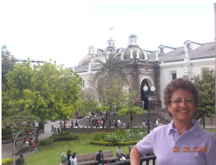
Downtown Quito Central Square - Main Cathedral