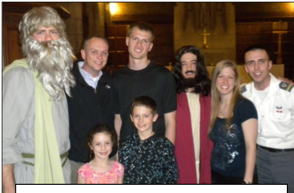
Living Last Supper – Peter, James & Crew

the group of our closest brothers/sisters/friends – all of whom I'd be fortunate to have as a son/daughter in law. And if you are single – please stay motivated – as there are many guys/ladies living holy lives – eager to please Jesus like you.