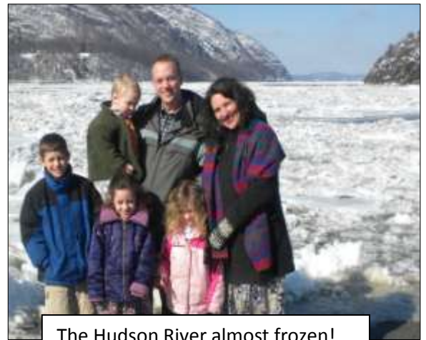
The Hudson River almost frozen!

“Equip the saints for work of service, for building up the body of Christ . . .” Ephesians 4:12