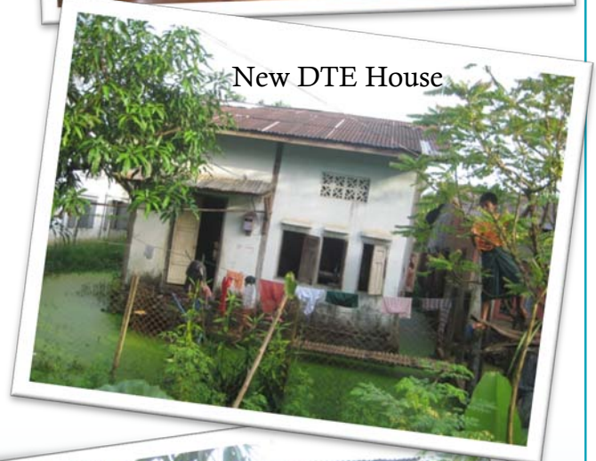
New DTE House