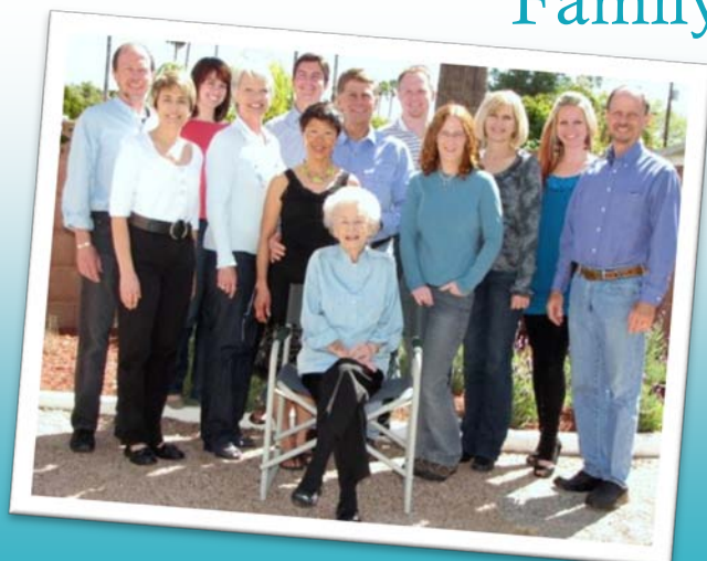
Nana's 90 th birthday in Phoenix