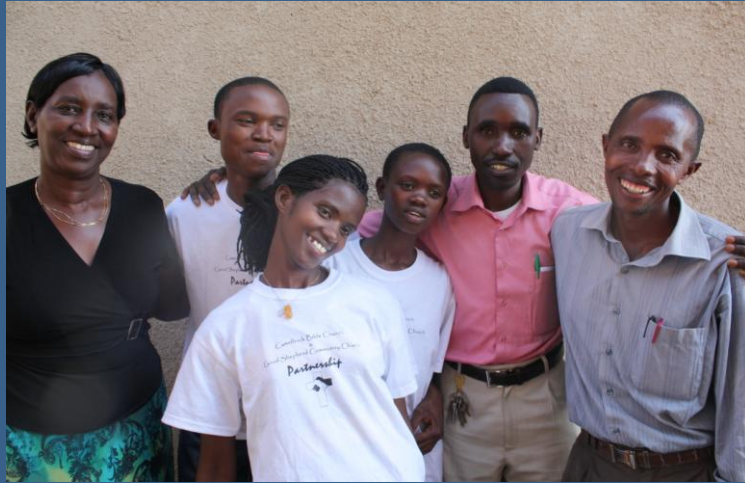
Members of the mentor team with Family 004