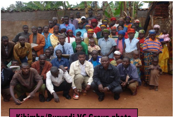
Kibimba/Burundi VC Group photo

During the vision conference in Kibimba, it wasn't only training but a discovery. We did discover how good it's to train rural people because they are not so used with training events like people in towns of Rwanda, Burundi and DR Congo. People in Burundi gave so many testimonies on how they were so blessed by the training. We had to stop the number of people giving testimonies because the number was big.