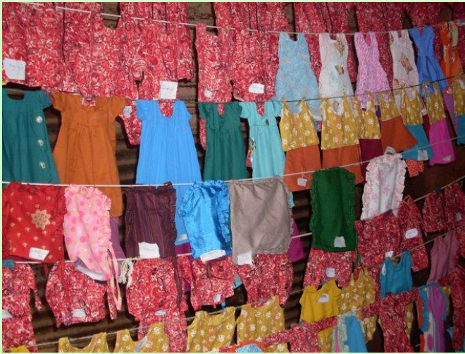
Sample dresses made by the participants