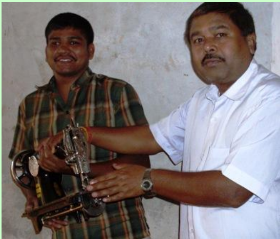
Jailer handing over two sewing machines to a male prisoner for the similar training to be provided for them.