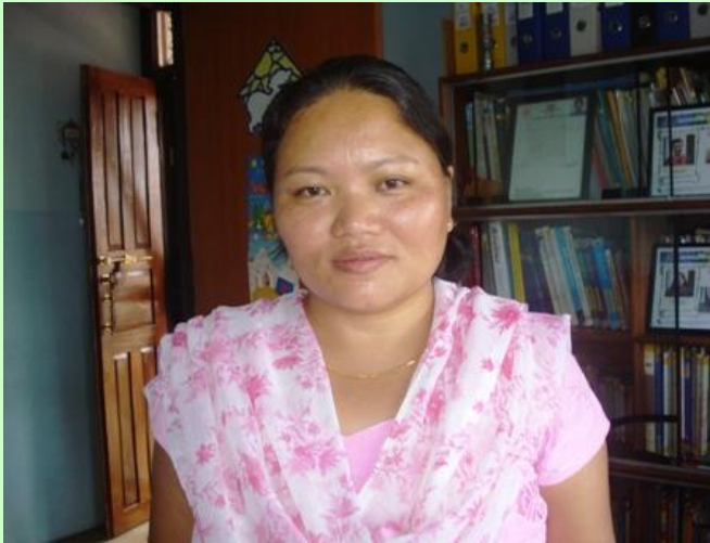
The trainer who led six prisoners to Christ