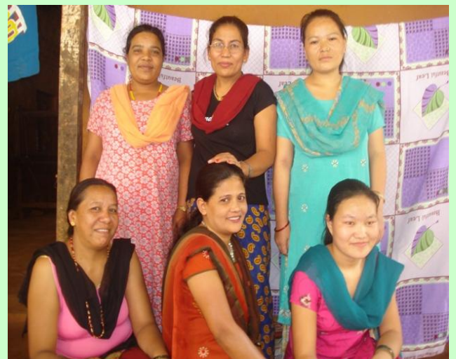
Six women who accepted Christ as their Lord and savior and ready for baptism