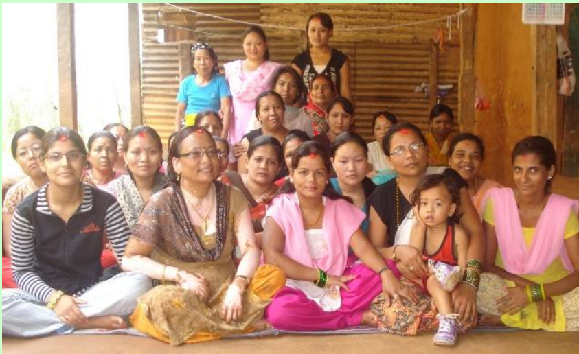
Eighteen Participants who completed the training

A glimpse of the graduation program of six-month sewing training to women in Tansen Prison on August 30 th 2010