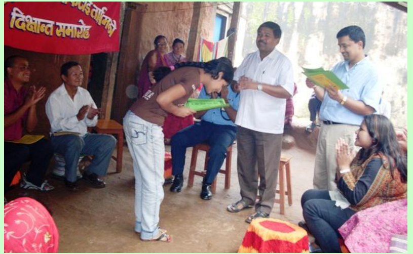
Certificate being provided to participants by the Jailer