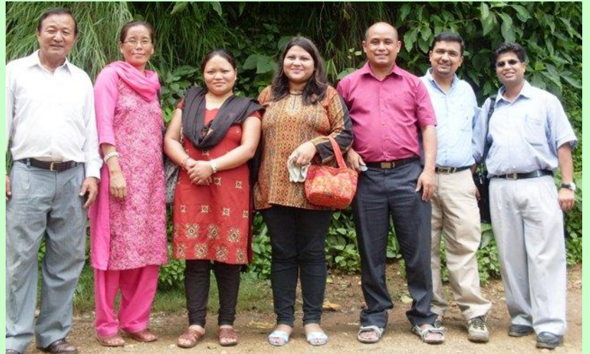
Pastors and leaders who contributed for the training