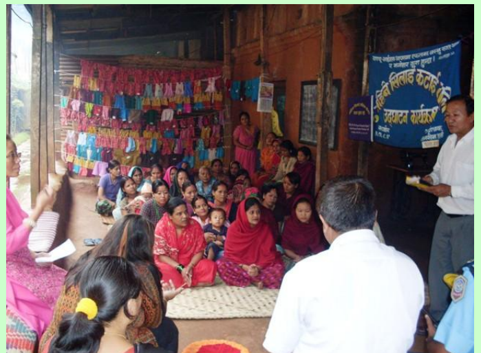
The Jailor, the Security officer and number of pastors and leaders attended the event