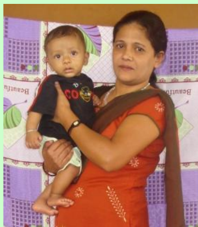
Kids living with their moms in the prison. The first with the smaller child came to Christ as she felt better as she was prayer. She is having ovary cancer. NHCC praying for God's provision for her treatment