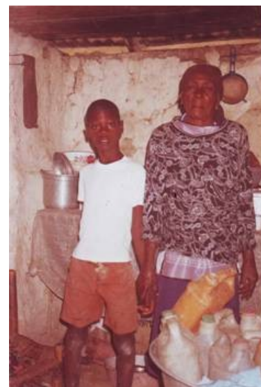
woman and her son