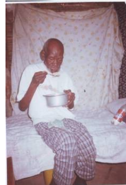
Taking care of and old poor man