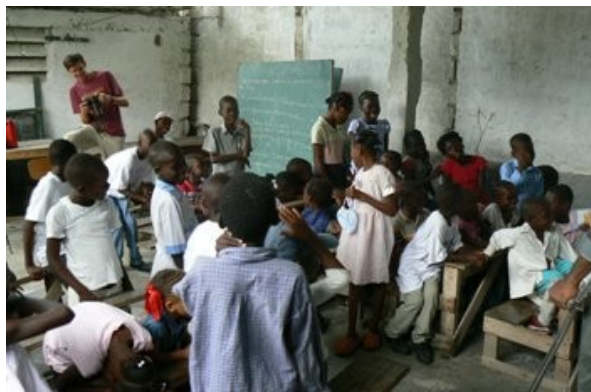
Recreative journey for poor children.