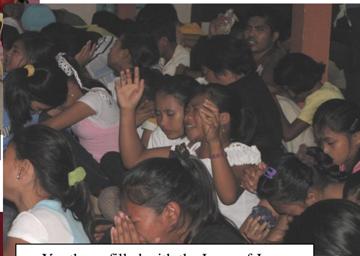
Youth are filled with the Love of Jesus