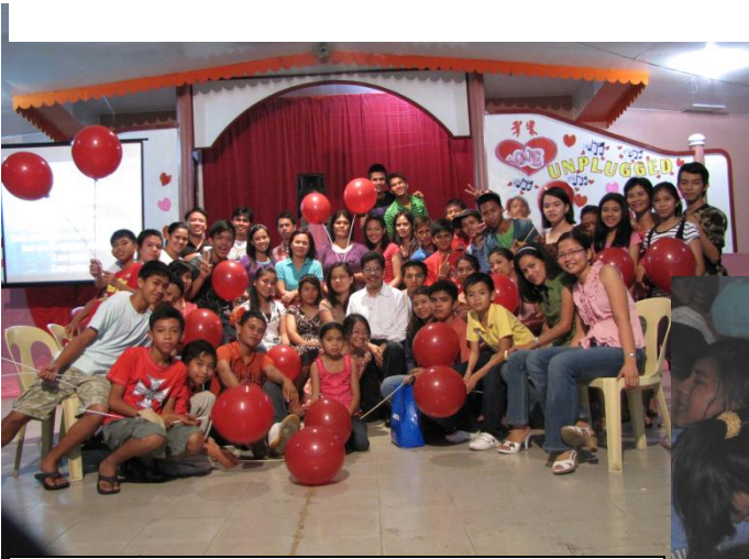
Youth in Cajidiocan, Romblon, Philippines

It was a simple address to the youth to explain that love can really wait, that they just enjoy their singlehood, discovering and developing themselves in to better, more responsible individuals, and hopefully at the end of it, they feel the desire that "Lord, I want to know you more".